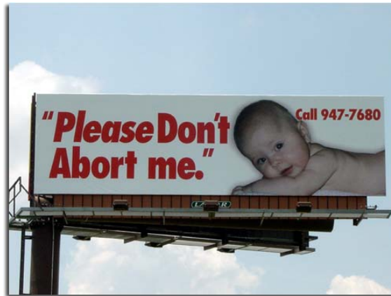
Helping to save babies everyday, our silent sentinel cries out along busy U.S. 41.

Consequently, I asked God for a way to "protest" this awful thing of abortion in our neighborhood and community. The billboard idea had been in operation with the Gospel message for a few years already at this time. With much prayer and spiritual searching, I preached on a Sunday night to our people on the subject and shared with them my heart. They responded with a commitment to put an anti-abortion message on the "best" billboard location available in our area.