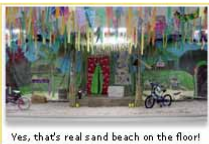
Yes, that's real sand beach on the floor!